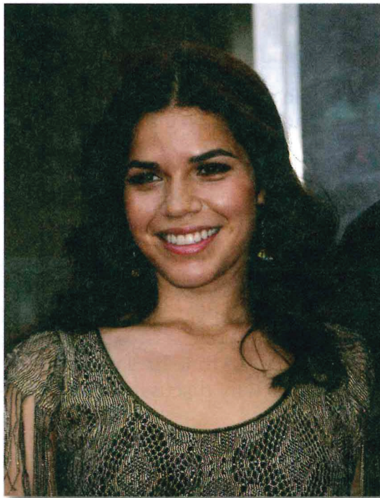
TV and movie star America Ferrera