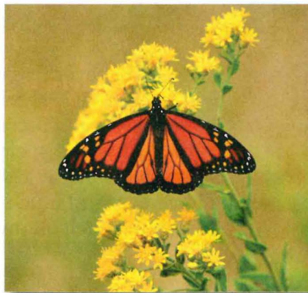
A monarch butterfly