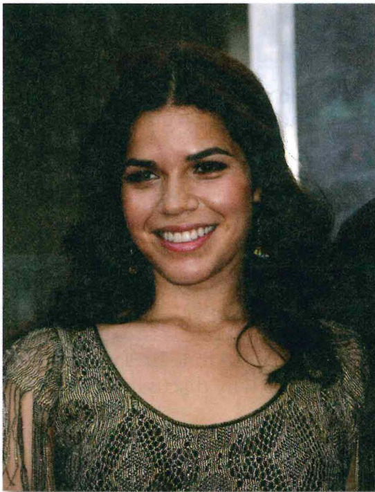
TV and movie star America Ferrera